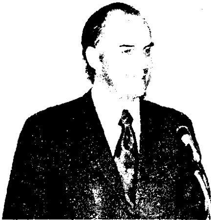
DANIEL J. EVANS Governor, State of Washington 1965 -

"If we are not willing to pay the price, if we cannot change where change is required, if we cannot prepare and carry out the programs so necessary to the conduct of expanding state affairs—if these things are not possible, then we have only one remaining recourse, and that is to prepare for an orderly transfer of our remaining responsibilities to the Federal government."